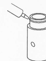
fig. 3 (how to glue)